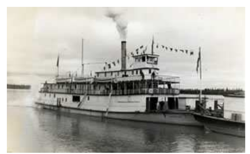
The Hudson's Bay paddle-wheeled steamer S.S. Distributor